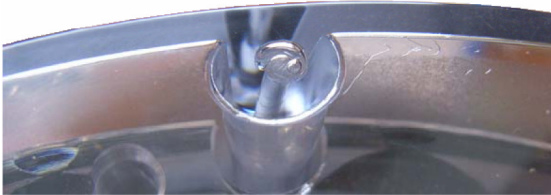
Figure 3: Older cover, with full surface seal

There are three versions covers manufactured recently. Signals that are not at risk have a full seal on the top of these pillars, as shown in Figure 3 and Figure 4