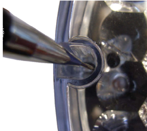
Figure 5: At risk covers, not moulded to the top.

Affected covers have the seal well down in the pillar. Figure 5 shows an example where a pencil can be inserted from the front of the cover. These are the only signals that need attention.