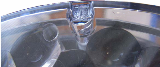
Figure 4: Latest cover with slightly recessed Seal.