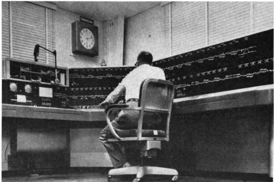
Union Traffic Control Center (Westinghouse Air Brake Co.)

Microwave radio, high-speed facsimile, automatic retarder classification, automatic hotbox detection, electronic data processing, electronic yards, train automation. This is railroading today, compared to the 1890 switching scene shown above. Modern railroad pioneering is more brains than brawn, and electronics is the nerve center of much current progress.