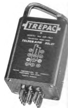
MODEL 539-PB/2 Replaces the A.E. type PTW-252

Telecommunications — Automation — Data Processing — Electronic Measurements — Batch and Process Controls — Comparators — Alarm Systems, etc.