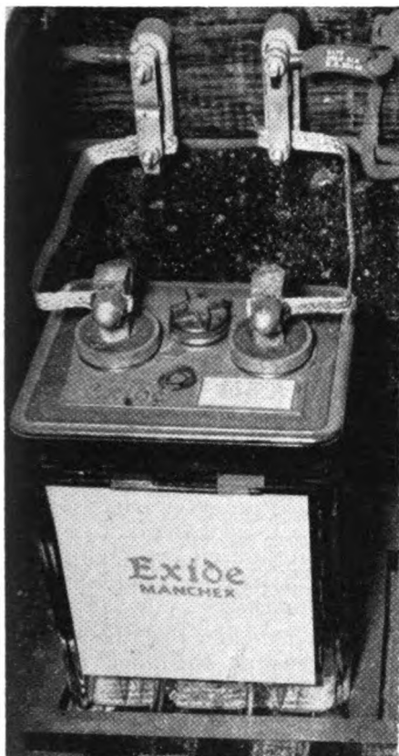
Battery feeds non-coded d.c. to track

lever is vertical (standing on center position), the signal is controlled to Stop. The lever is turned 90 deg. to the right to clear the signal for traffic movement to the right, and turned 90 deg. left to clear the signal for traffic movement to the left. A green indication lamp is above the "R" and "L" positions of the signal lever. After the signal clears the indication lamp will light, so informing the operator. Below the row of signal levers is a row of two-position switch levers that stand vertical for switch normal, and are turned 90 deg. to the right for switch reverse. A white indication lamp in the center of the switch lever indicates when the switch is out of correspondence with the switch lever, otherwise the lamp is dark. Below the switch levers is a row of push-buttons. These are code starting buttons, and are pushed each time the operator desires to send a control code into the field to operate a switch, clear a signal or unlock an electric lock on a handthrow switch. Indication lamps are located above the code starting buttons. The control machine is also equipped with an annunciator bell which rings when a train enters the approach sections to the interlocking. White indication lamps are located in the track diagram on the approach sections which are lighted when indicating track occupancy.