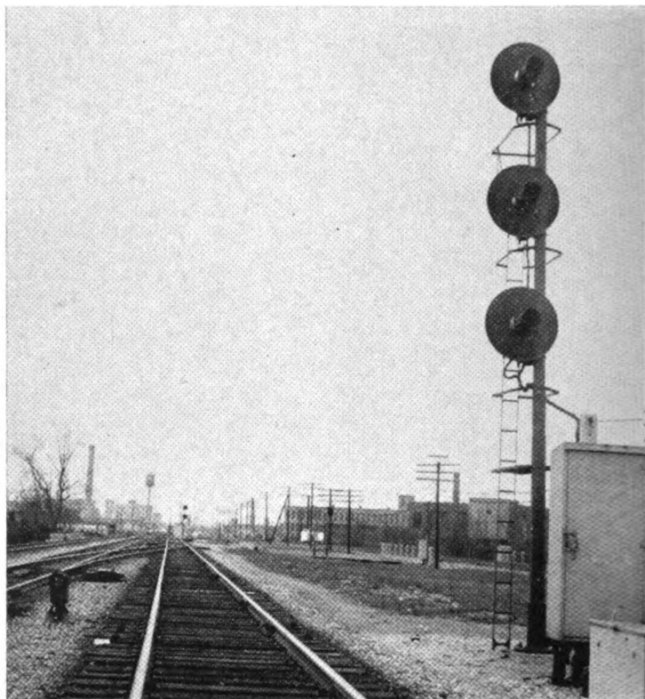
View of signals 22L and 16L looking toward West Detroit

These interlockings are controlled by a GRS type K, class M 2-wire coded CTC system from desk type control machines. Because the control machines are similar, the description of a machine will apply to either one. The control machine, mounted atop the operator's desk in the tower, contains the conventional track diagram, with the tracks represented by a white line \frac{1}{4} in. wide.