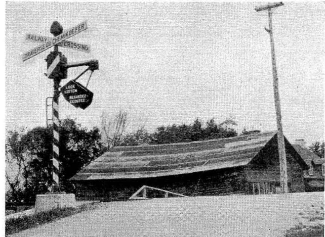
Wigwag signal at a crossing in Quebec

Any desired speed may be chosen, above which the wigwag will operate from two track circuits approaching the crossing, and below which it will operate from only the one track circuit adjacent to the crossing. In the installation for which this circuit was designed, critical speed was taken as 60 m.p.h. Track circuits C and D