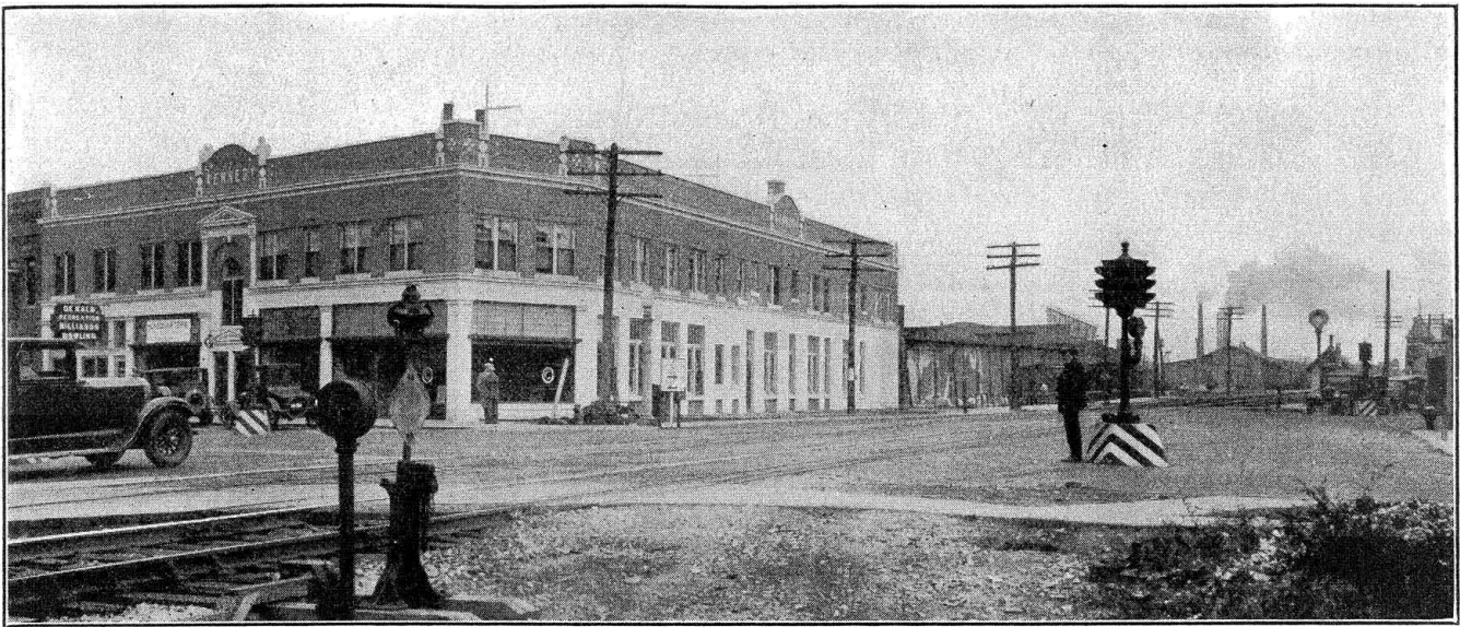
View looking across Lincoln Highway and east along C. & N. W. tracks