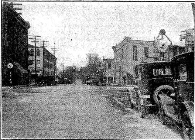
Third Street looking north showing that wig-wag banners can be seen over cars parked at curb

An agreement was therefore made between the city and the railroad to remove the crossing protection in service at the several crossings, including