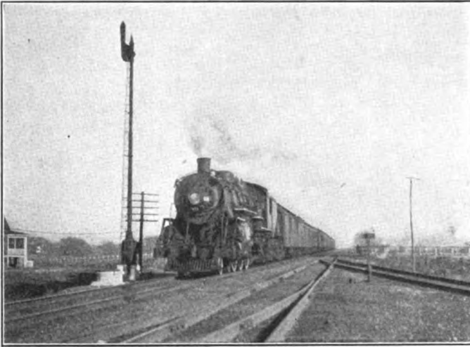
Rocky Mountain Limited Westbound in Train Control Territory

At a signal indicating "stop" the ramp is de-energized; hence, as there is no current for the shoe to pick up, it functions to cause the air pressure to be reduced in the train line to give a service application of the brakes. Upon encountering this stop indication the engineman