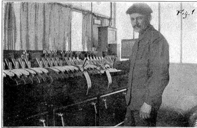
The Electric Machine Has Peculiar Locking Arrangement

A "checkerboard" signal in the "Stop" position is shown in the second photograph directly over the German cars. The rear of the signal is shown, including the oil lamp, which is a part of the signal and moves with it. The "Clear" position is indicated by turning the whole signal through 45 deg. by means of an electric motor situated on the signal mast. The edge of the "checkerboard" is then towards an oncoming train and by night a white light is shown, the lamp having two lenses. The motor operated mechanism might be compared with the