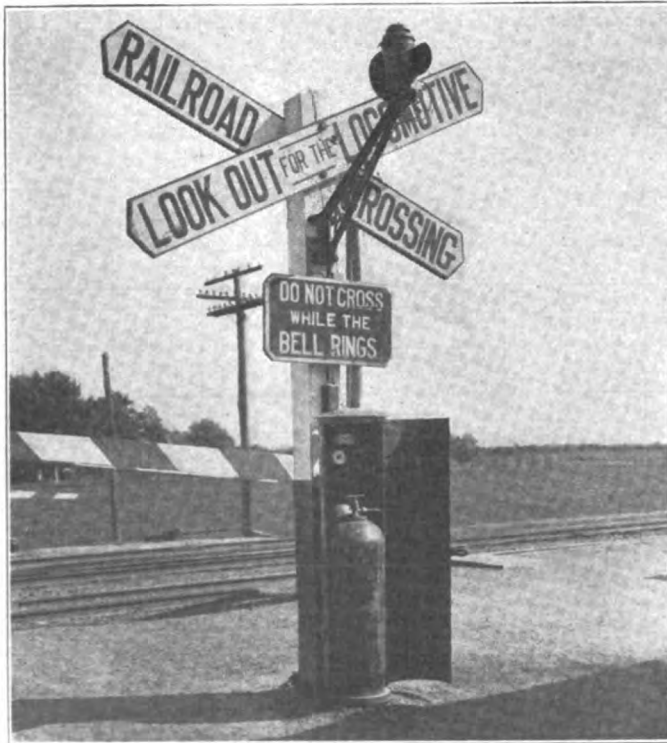
One of the Flash Light Crossing Signal Installations

The close-up view of one of the equipments shows clearly how the arm was bolted to the existing sign post. This arm carries the lamp which stands out 29 in. from and a little above the center of the sign. The acetylene for the light is compressed into the 12 in. by 36 in. seamless steel tank of 225 cu. ft. capacity seen at the bottom