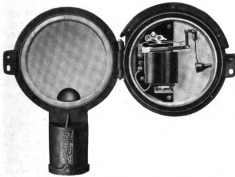
The Improved Style E Chicago Crossing Bell.

The special features of the improved style E crossing bell, of the Chicago Railway Signal & Supply Company, Chicago, which has recently been developed, include simplicity, inter-