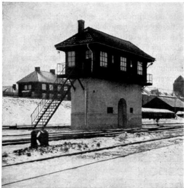
R 40 Signal Tower at North End of Station Yard.

A schematic view of the modern arrangements of this passenger station is shown on the above track plan. Three wide intermediate platforms (2, 3 & 4) have been constructed, and are connected to platform 1, outside the station house, by means of a tunnel, making it unnecessary for passengers to cross the tracks when changing trains. The tracks which are situated next to the platforms are used for passenger trains, and