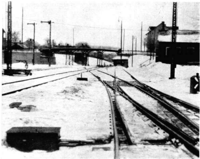
R 42 Double Point and Starting Signals at South End of Station Yard.

The electric interlocking plant, comprising the passenger station only, has been built by Signalbolaget, the electric apparatus being delivered by L. M. Ericsson and the mechanical details (semaphores, skotch blocks, base parts and connections for the operating devices, etc) by Avos. This plant, at the present time the largest in Sweden, is divided into two signal cabin zones, one at each end of the station yard. Each zone is equipped with an interlocking machine from which points and signals are operated.