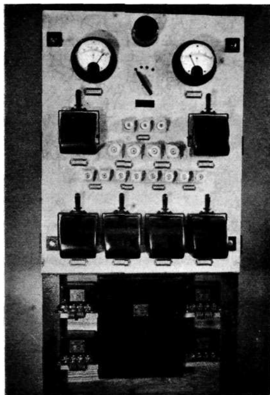
x 1373 Fig. 3. Distribution panel of the power plant.

supply the second is automatically disconnected and the first one is connected anew.