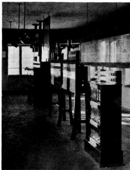
X 1366 Fig. 1. Interior view of the interlocking plant in Warsaw—WCZ.

The interlocking machine has 8 signal switches, 14 point switches and 2 reserve positions. On account of the use of electric interlocking, each signal switch operates a whole group of home signals for one direction or starting signals for another.