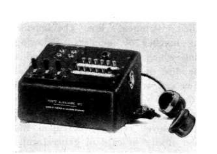
Fig. 4 x 3581 Central apparatus for special dispatcher