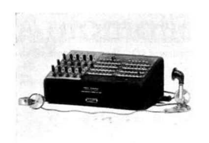
Fig. 3 X 3614 Central apparatus for dispatcher