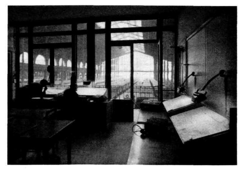
Fig. 2 x 5290 Dispatching office at Gare du Nord