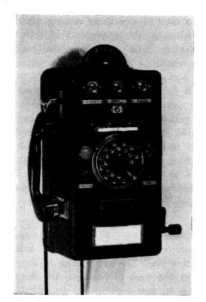
Fig. 6 X 3584 Central apparatus for twenty positions