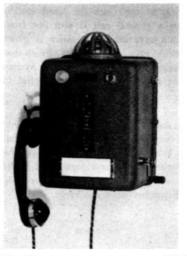
Fig. 7 x 3583 Central apparatus for two positions

The central apparatus at le Bourget-Triage, Fig. 6, is fitted with a dial with twenty positions, with a magneto as reserve current supply. The apparatus at the other stations, Fig. 7, contains two switches for call by magneto to one of the other two central apparatus. On the upper part of the apparatus there are a bell with cover, a lamp and an annunciator. The selector and other devices are mounted inside the apparatus on a frame which can be swung out.