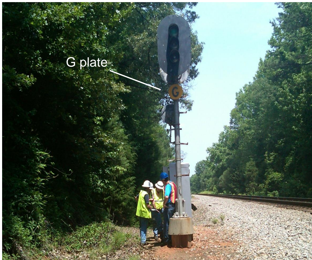
Figure 3. NTSB signal investigators inspecting signal at MP 316 with attached G plate.

48 mph just before the collision. Event recorder data showed no evidence that the engineer had applied the train's brakes before the collision.