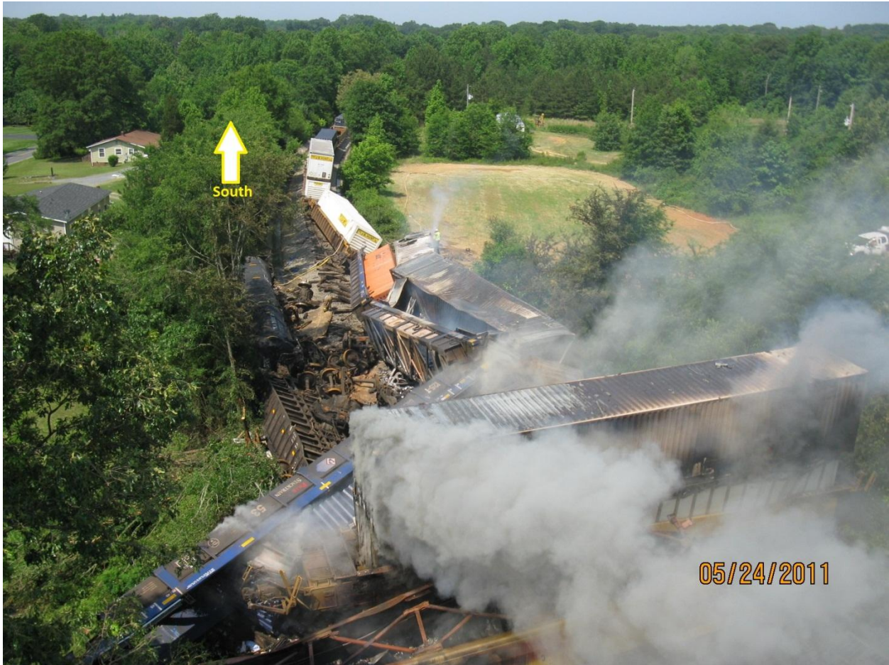
Figure 1. View of accident site showing derailed cars from the striking train.

CSX train movements in the area of the accident were governed by wayside signals, controlled by CSX train dispatchers in Florence, South Carolina. The maximum authorized speed for freight trains on the Monroe Subdivision was 50 mph.