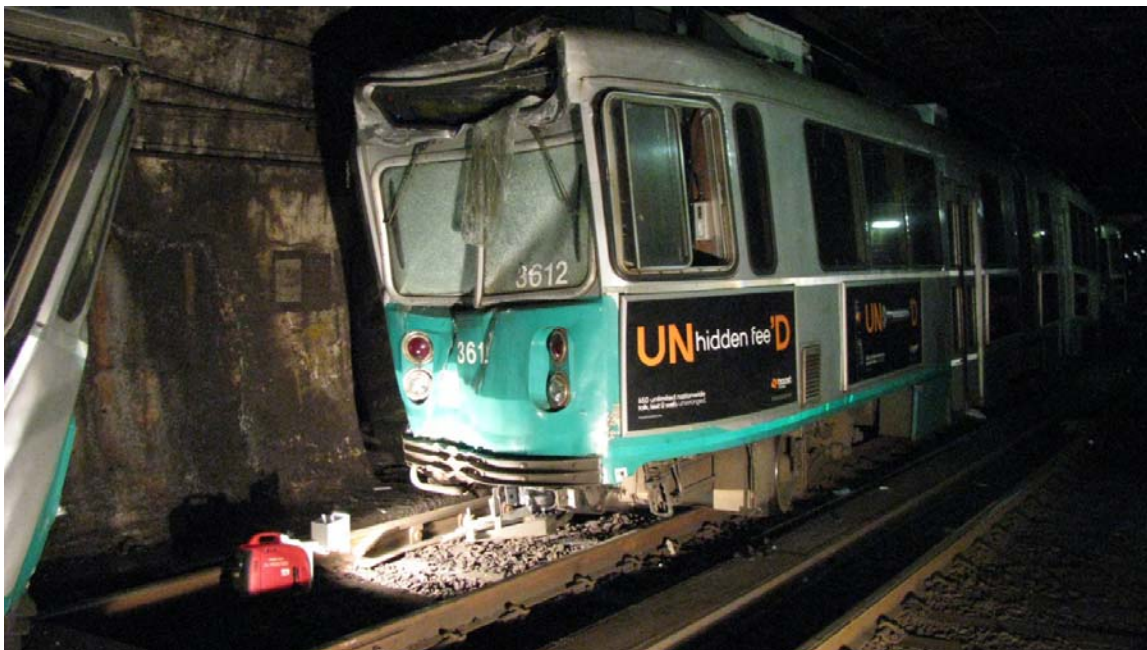
Figure 2. Photograph showing damage to front (cab) of striking train 3612.

Train 3612 had struck standing train 3808 while it was stopped behind trains waiting to enter Park Street Station. (See figure 2.) The rear of standing train 3808 was about 98 feet beyond a red signal, and the left rear red marker light was visible to the pilot operator of striking train 3612 for 447 feet. (See figure 3.) Both rear red marker lights of the standing train were visible for 216 feet, and the entire rear end of the standing train was visible for 80 feet. (See Sight-Distance Test later in this brief.)