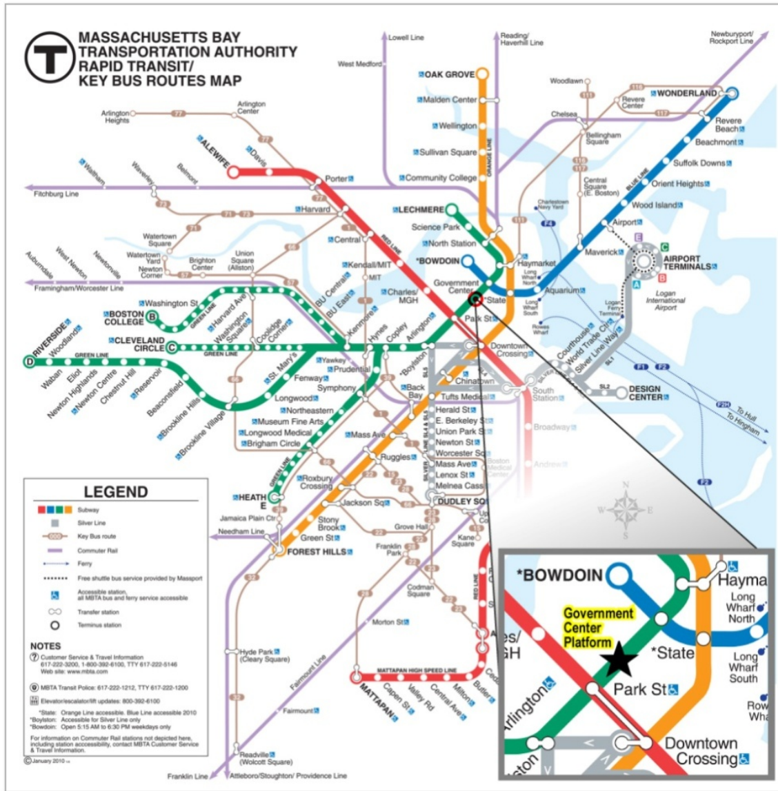
Figure 1. MBTA system map showing accident location.

notified the passengers of a momentary delay because of congestion caused by trains ahead. (See figure 1.)